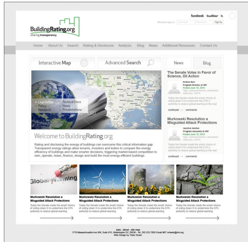
Draft buildingrating.org homepage for example only

The site will house a searchable database of reports, legislation, technical information, policy analysis and other research on rating and disclosure. It will include an interactive world map as well as advanced search capabilities. We envision Buildingrating.org as an educational resource and a global best-practices network for policymakers, researchers, advocates, real estate stakeholders and the public. The website will also feature news and blog sections, with guest commentary from local and global experts on building energy efficiency and energy policy.